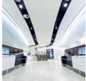
Last month's picture Fast Track area at Heathrow's Terminal 5